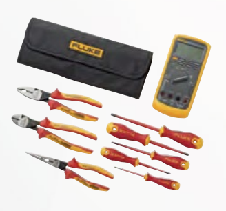
Fluke 87V Industrial Multimeter + Insulated Hand Tools Starter Kit - IB875K