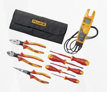
Fluke T6 Electrical Tester + Insulated Hand Tools Starter Kit - IBT6K