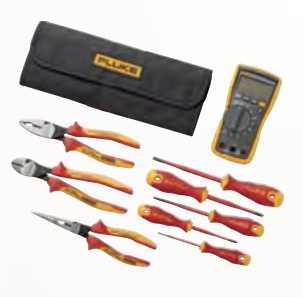
Fluke 117 Electrician's Multimeter + Insulated Hand Tools Starter Kit - IB117K