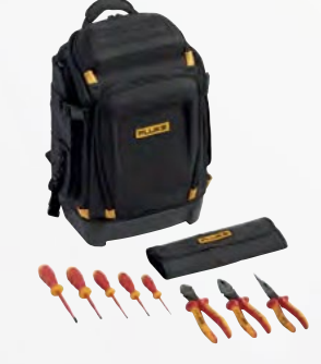
Fluke Pack30 Backpack + Insulated Hand Tools Starter Kit - IKPK7