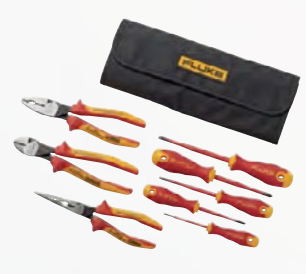
Insulated Hand Tools Starter Kit - IKST7