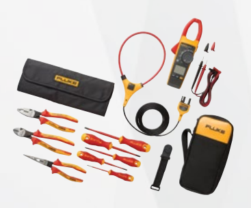
Fluke 376 FC Clamp Meter + Insulated Hand Tools Starter Kit - IB376K